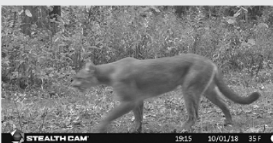
This mountain lion was caught on a Michigan Department of Natural Resources game camera Oct. 1 in Gogebic County.

Michigan cougar confirmations have been derived from trail camera video, photographs, tracks, scat, or