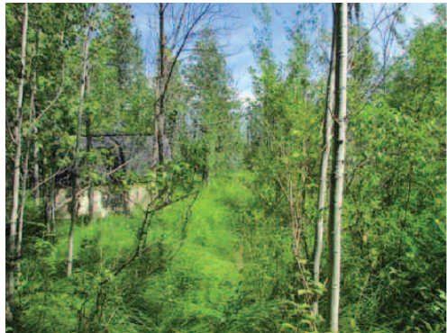
SIX MILE LAKE ROAD • EAST JORDAN

How would you like to own 67' of frontage on Beals Lake? Look no further, great fishing and a wonderful area to set up camp and just take in the beautiful views of nature. Property also has a 14' drive well. MLS #456738. $15,000