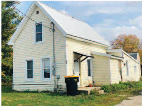
203 ELM STREET • EAST JORDAN

Affordable home located close to schools and walking distance to town and Lake Charlevoix. Are you looking for a little Up North getaway? Close to snowmobile trails and boat ramps for the those fisherman in the family. Call today to make sure this one doesn't getaway! MLS #456857. $49,900