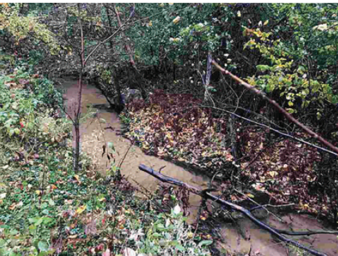
108 WILSON DRIVE • EAST JORDAN

Great City lot in East Jordan with a Creek running through the property. Close to Lake Charlevoix, Jordan River and snowmobile trails. Start building your dream house today! Approved for single wide mobile homes. MLS #456910. $20,000